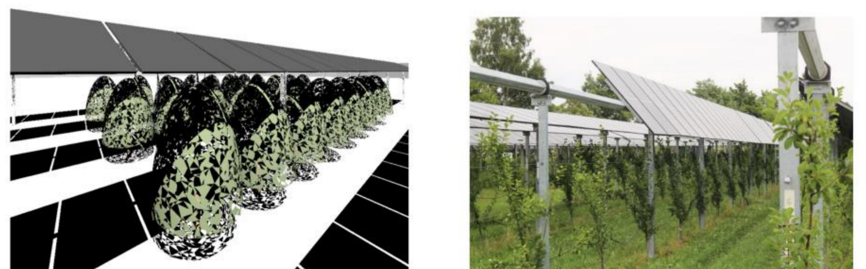
Figure 3: 3D rendering (© Fraunhofer ISE) and picture (© Intech) of the pilot project in Nussbach